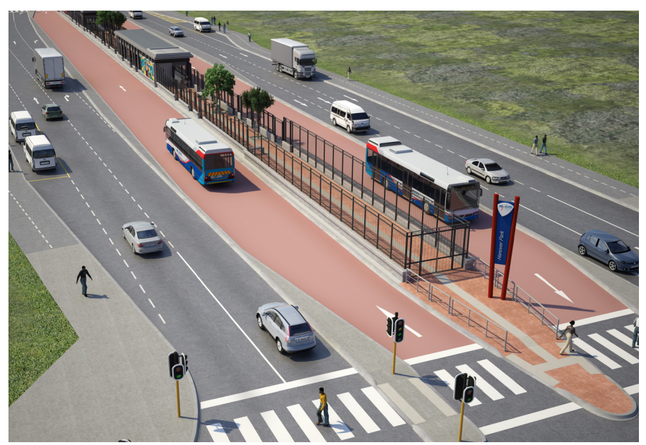
An artist impression showing future MyCiTi services and an improved road network for all.

Work will involve reconstruction of roads with dedicated bus lanes, stops and stations, upgrading intersections with traffic signals, safer walking and cycling features and landscaping. The significant investment is also creating short-term job and business opportunities for locals in each area to assist with construction and by reducing congestion and vehicle emissions, MyCiTi will help contribute to a greener, more sustainable Cape Town.