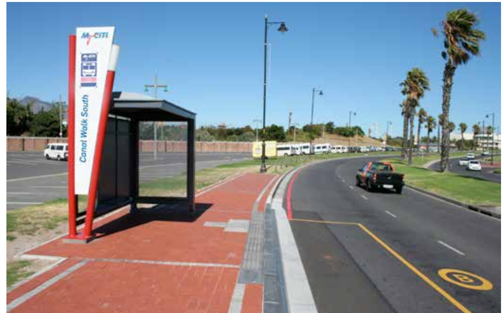
Passengers can catch MyCiTi at stops like this one.