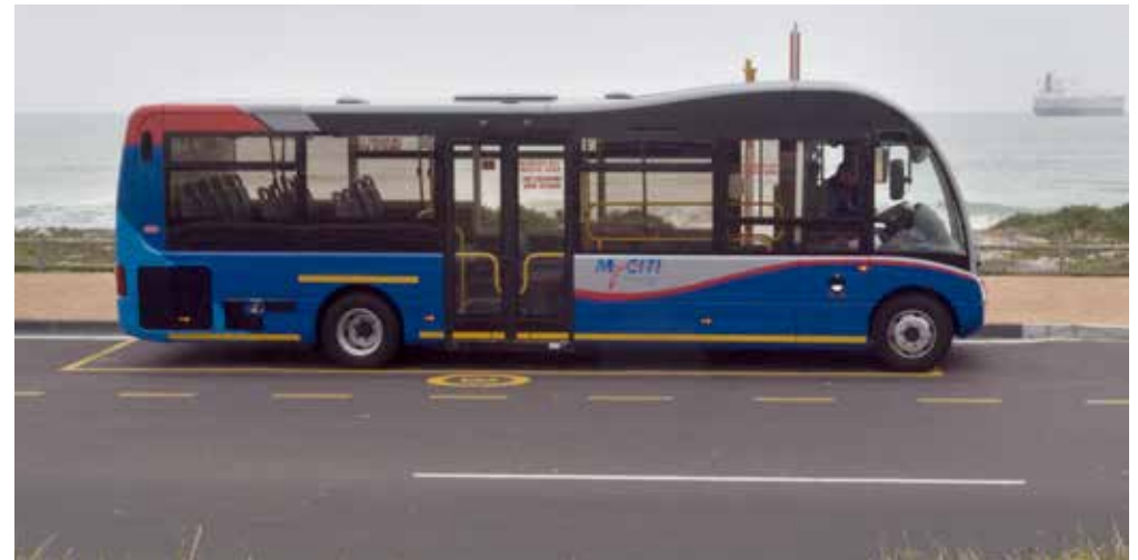
MyCiTi services will operate in more areas from 2 November 2013.

For more information: Call the Transport Information Centre (toll-free 24/7) 0800 65 64 63 Visit www.myciti.org.za