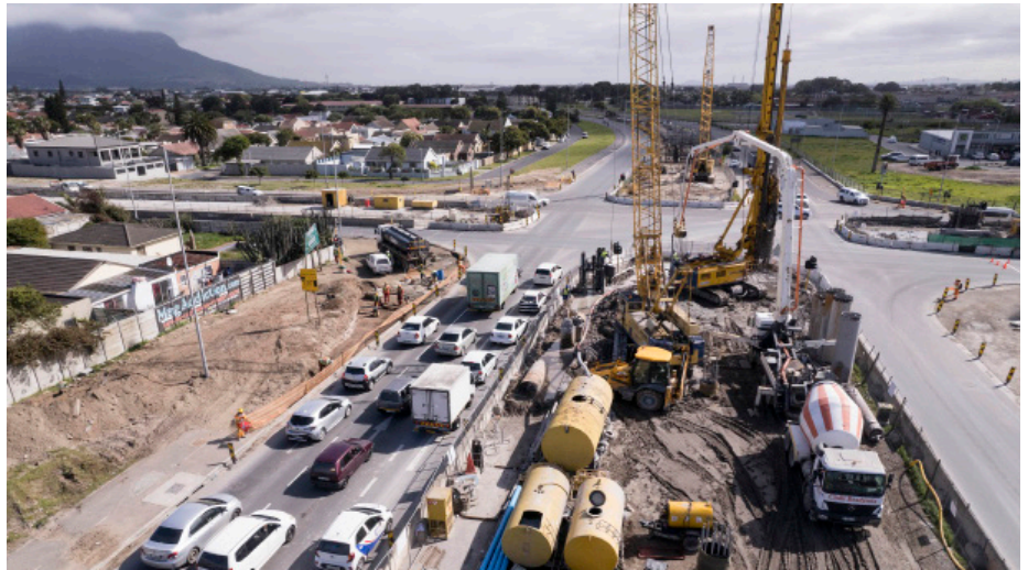
The "Sky Circle" will bring significant travel time savings for commuters in Phase 2A.

Traffic diversions at the intersection are ongoing in order to accommodate work to widen the entire westbound carriageway of Govan Mbeki Road, from Heinz Road to Strandfontein