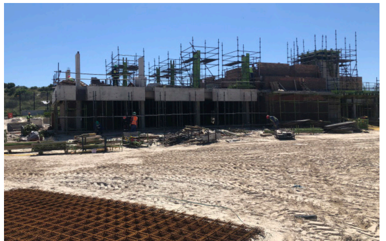
The construction of the depots in Mitchells Plain and Khayelitsha commenced in August 2023 and is now 30% complete.

Meanwhile, road users in the vicinity are advised to be aware of construction and the many delivery vehicles entering and leaving the site via Mew Way and Spine Road.