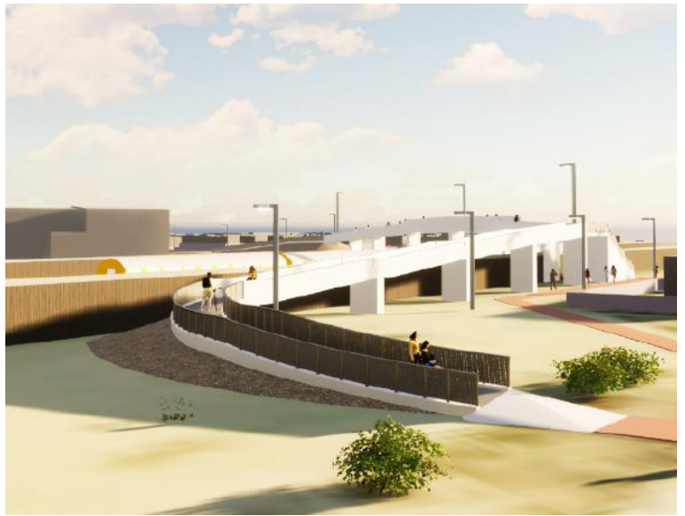
The pedestrian bridge is planned to be ready for use in November.

Upcoming work includes screeding the bridge deck, installing fencing, commissioning street lights and the planned CCTV surveillance for added safety.