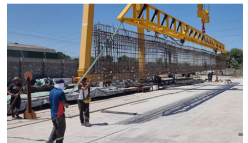
Precast beams for a new bridge.

Construction is planned for around 3 years, with roadworks limited to weekdays between 09:00 and 15:00 to help avoid busy, peak traffic periods.