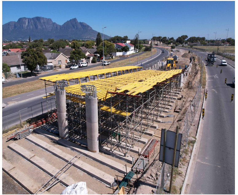
The ramps leading to the elevated traffic circle are under now construction.

Roadworks continue to affect traffic flow but provision is made to keep two lanes open in each direction of travel at all times.