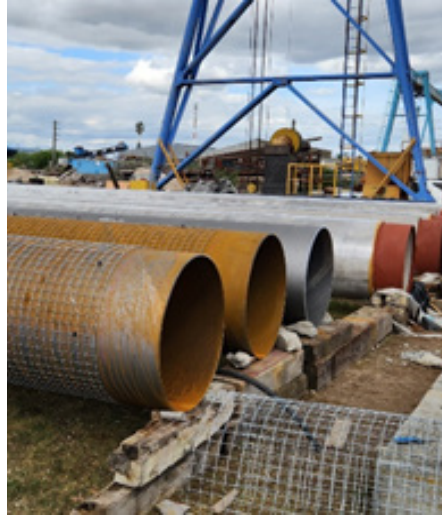
The highly specialised steel pipes.

New steel pipes have been produced by a Durban-based company that was required to move their equipment to Cape Town so that the pipes could be manufactured locally and transported a short distance to site.