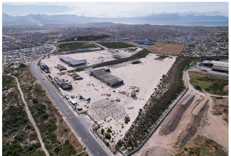
The depots will serve as a base for Phase 2A operations.

Next up will be paving the staging area for the east depot, installing a permanent water connection to both depots and finishing external building work for the west depot.